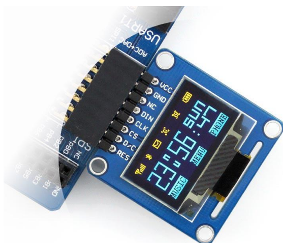
Figure 1: OLED information display

OLED displays information as Figure 1 shows.